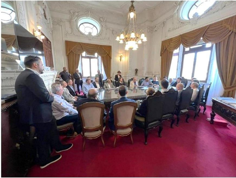
Meeting at the Piratini Palace - Headquarters of the Government of the State of Rio Grande do Sul