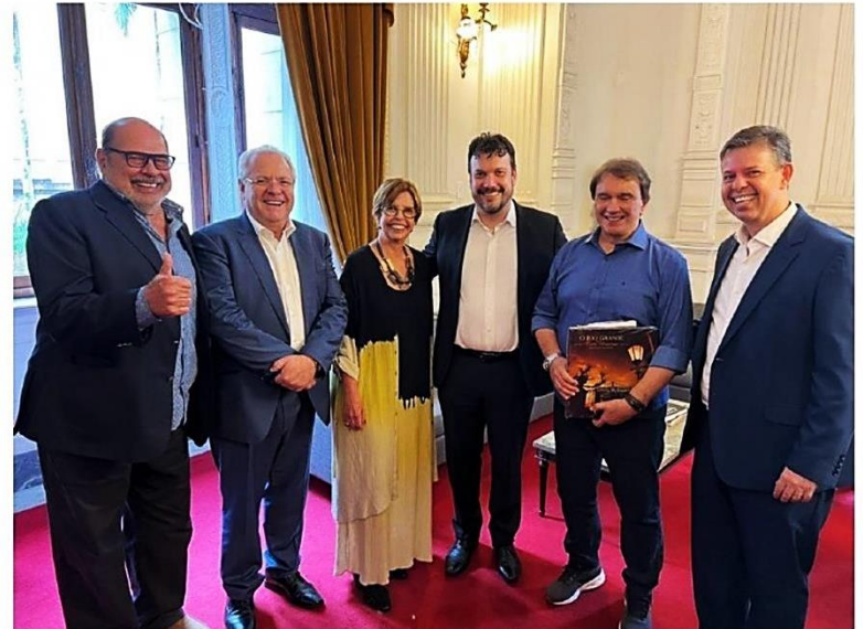
Meeting at the Piratini Palace - Headquarters of the Government of the State of Rio Grande do Sul