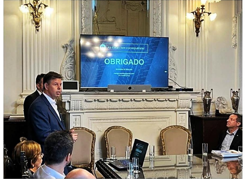
Meeting at the Piratini Palace - Headquarters of the Government of the State of Rio Grande do Sul