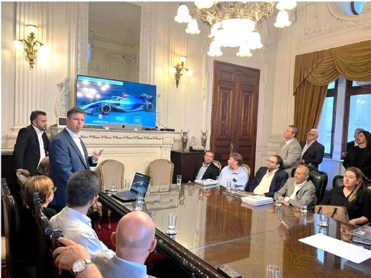
Meeting at the Piratini Palace - Headquarters of the Government of the State of Rio Grande do Sul