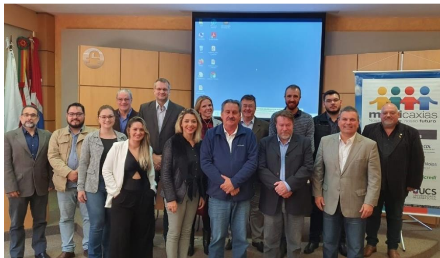
General Assembly - Regional Train of Serra Gaúcha.

Finally, it was said that most of the investments in the Project will remain in Brazil, as equipment will be purchased from Brazilian companies such as Marcopolo and Randon. It was also mentioned the production of a miniseries about the Regional Train of the Serra, which will have three seasons and will show from the process of construction of the railway network to the train fully operational.