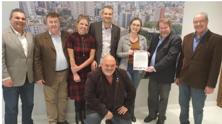
The conclusion of the extraordinary meeting of the members to the technical council for the Regional Train of Serra Gaúcha.